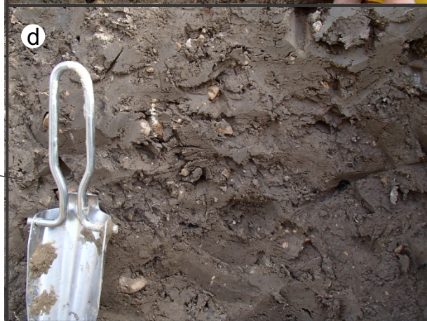
Figure 28: Photos of sediments present at section 15112TH097: a) river-view of the river cut exposing sediments; b) upper sand; c) inter-till clay seam. Contacts are highlighted by the white dashed lines; d) lower till.